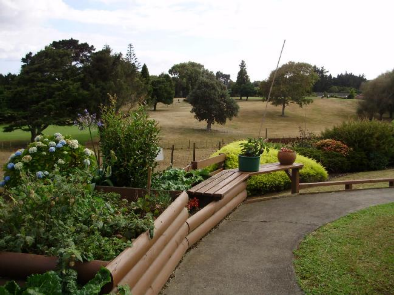
The view from the back of the Hospital

Franklin Memorial Hospital in Waiuku is located in country-like surroundings with rural views.