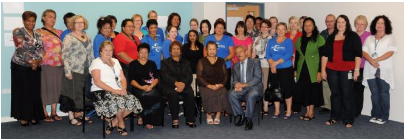
Staff gather for the blessing of the expanded BreastScreen Clinic

For the first time ever, all of the staff from BreastScreen Counties Manukau are located in one place thanks to the expansion of the Screening Clinic at the Manukau SuperClinic (MSC).