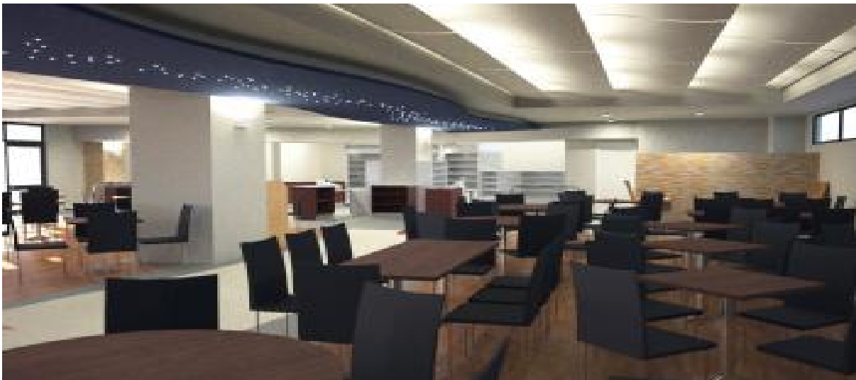
Graphic of the new staff cafe

There will be options that cater for everyone,” says Marianne Scott, Service Improvement Manager. “For example there will be a separate snack bar and vending machines for people wanting a bite on the run, free hot drinks vending machines, cold water fountain, a selection of hot and cold foods prepared by our very own kitchen, microwaves for those who wish to heat up their lunch and a staffed coffee bar for all those coffee lovers.