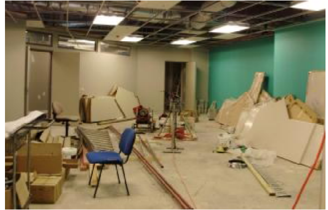
Allied Health Gym – Ground Floor