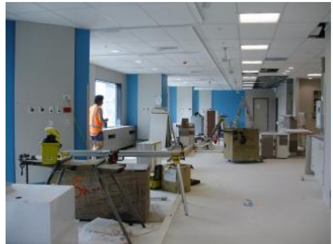
Gastroenterology – Recovery: Level 2