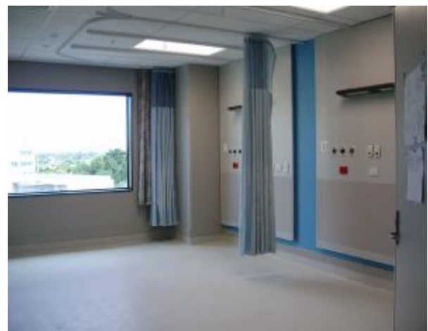
4-bedded room Plastics Ward: Level 5