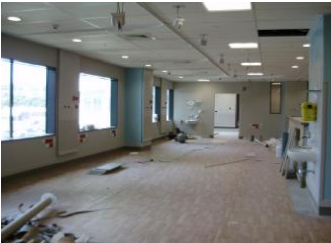
Haematology Day Ward – Level 1