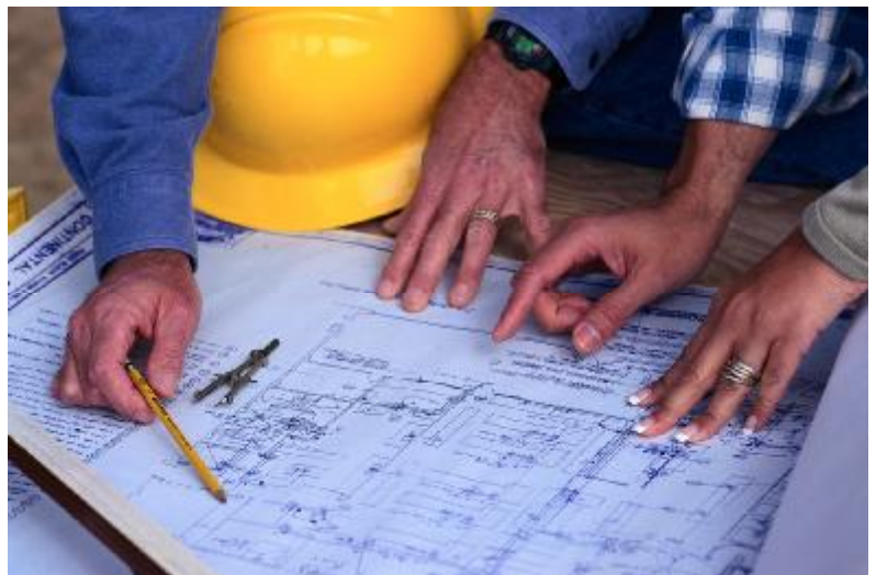
A lot of planning has been going on behind the scenes for the CSB

This will involve making alterations to the roadway at the back of AT&R, temporary closure or rezoning of some carparks, relocation of services and departments, demolition of the Rainbow Corridor and construction of links (temporary and permanent) between buildings.