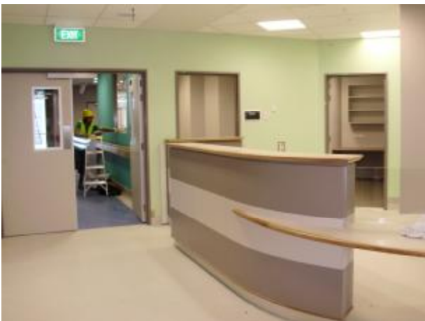
Nurses Station – MHSOP: Level 5