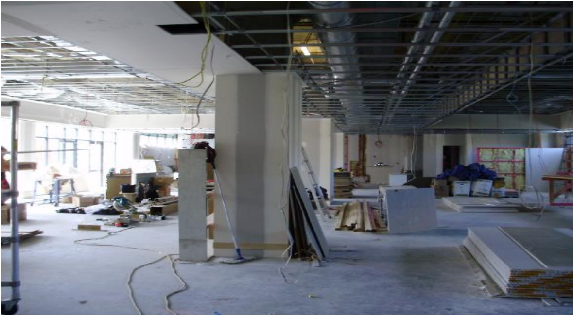
Construction is progressing

The new staff only cafeteria on the Ground Floor of the Edmund Hillary Block will be modern, welcoming and relaxing.