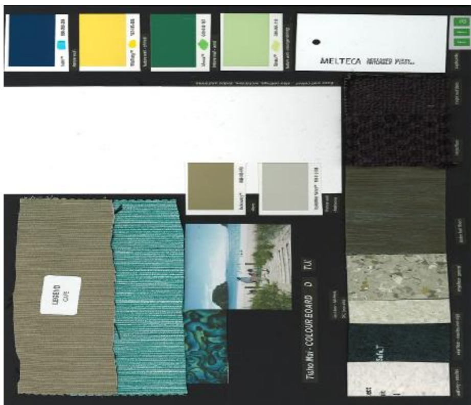
Colour Board for Tui Ward - Tiaho Mai.

All areas throughout Tiaho Mai will get new carpet and freshly painted walls. Vinyl will be replaced in specific areas and air-conditioning installed into parts of Huia that have poor air flow.