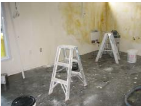
Construction of the new Birthing Room