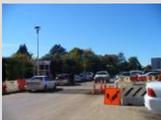
The underground pipes cross the road