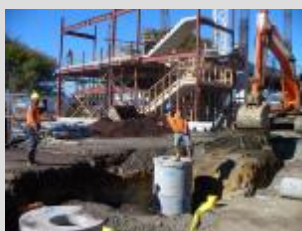
Underground pipes are being laid.