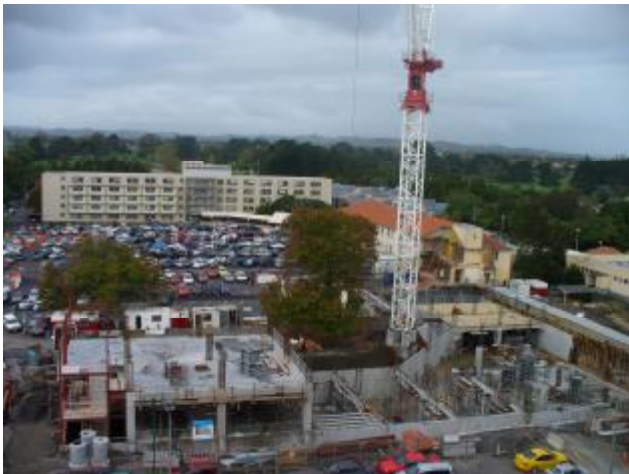
New Ward Block