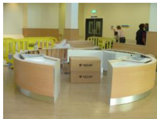
The new Information desk

The Information Desk will be staffed 7days per week 12 hours per day with up to 3 volunteers on a day shift.