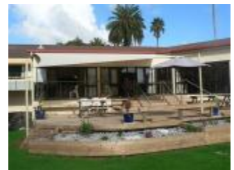
Tamaki Oranga – an outdoor area was constructed to encourage use of the grounds by patients.