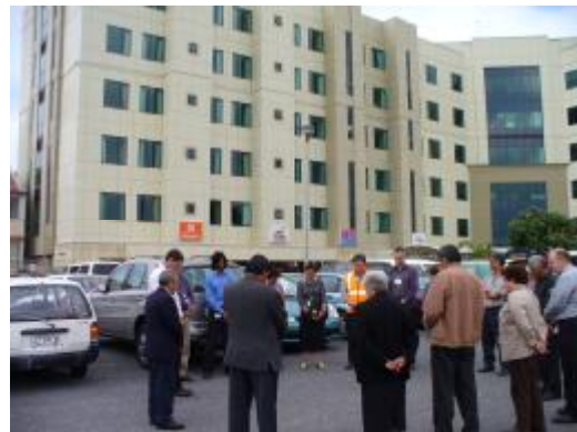
The new Ward Block will extend out into the carpark.