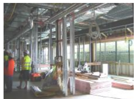
Paediatric rooms are being framed.