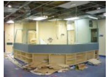
Demolition works underway for new ICU