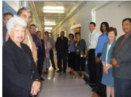
Farewell to Building 6

As the land will soon be disturbed, respect was given to mother nature through karakia (prayer and incantations).