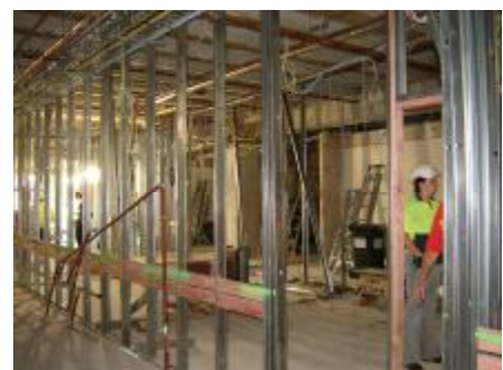
Wall framing is 70% complete.