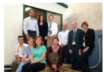
The Gastroenterology team outside the new Portacom