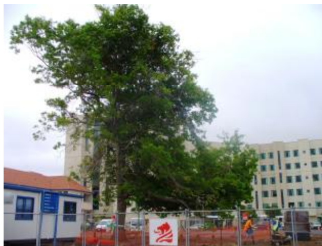
One oak tree remains

As part of the new Ward Block Project we will be replanting some new trees in the future.